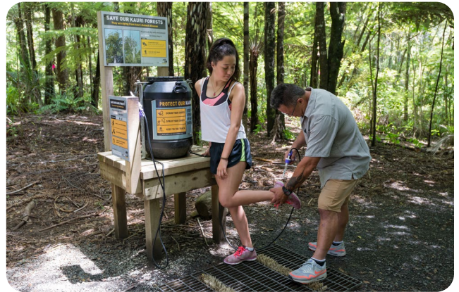
Cleaning your footwear and gear helps protect Kauri

For more information, visit www.kauriprotection.co.nz/national-plan